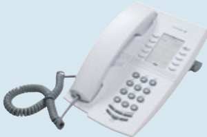
Dialog 4147 Medium analog phone