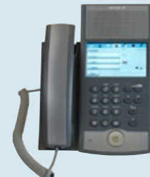
Dialog 5446 IP Premium IP phone